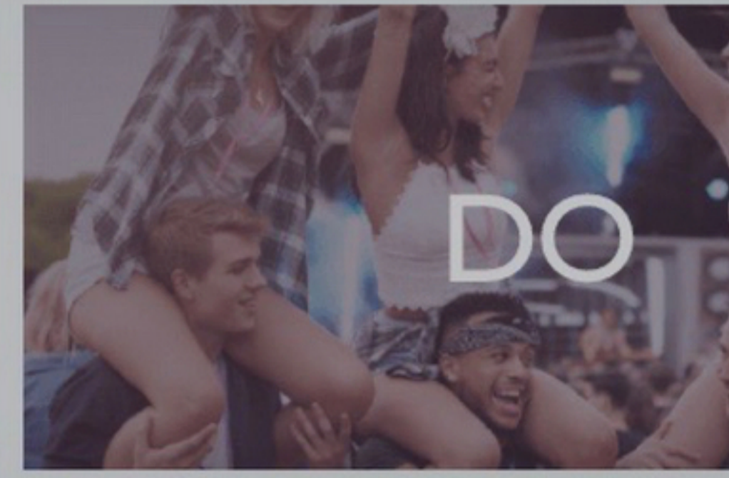
DO | Engage in the best things to do.

Eat New York City > Eat > NYC's Best Burgers In Surprising Places