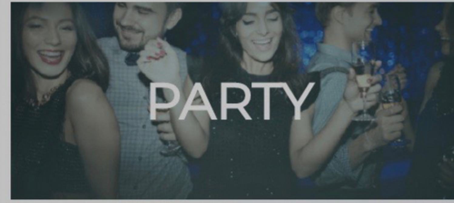
PARTY | Enjoy the best nightlife the city has to offer.