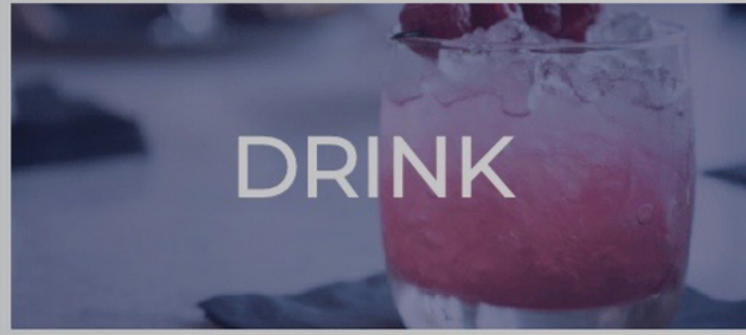
DRINK | Experience the best of beer and cocktails.